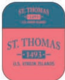
TEAL / CORAL SILK