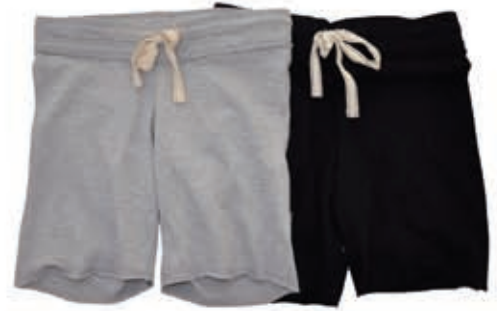
HEATHER GREY BLACK