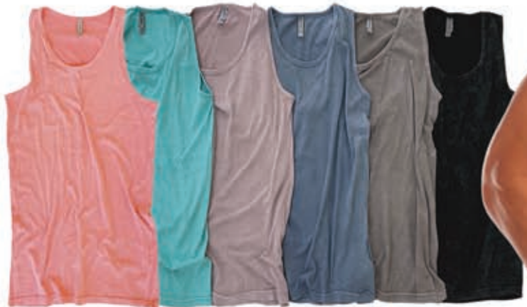
GRAPEFRUIT TEAL MIST SMOKEY BLUE DOVE GREY SHADOW