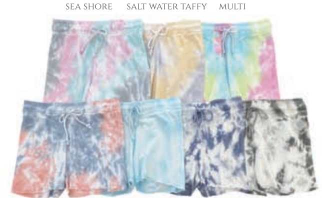
SEA SHORE SALT WATER TAFFY MULTI STARFISH SKY BLUE CHAMBRAY CHARCOAL