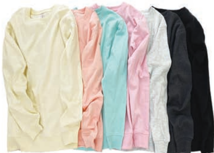
BUTTERCUP NECTAR MINTY PINKY HEATHER CHARCOAL BLACK ASH