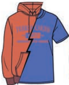
FADED CORAL / ROYAL