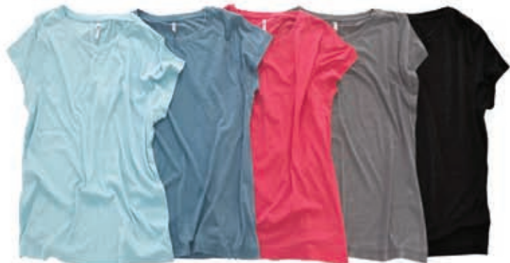
WATER CHAMBRAY POPPY RED STONE ANTHRACITE