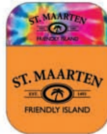
SWIRL PASTAL / ORANGE