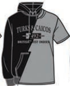
BLACK / S. GREY