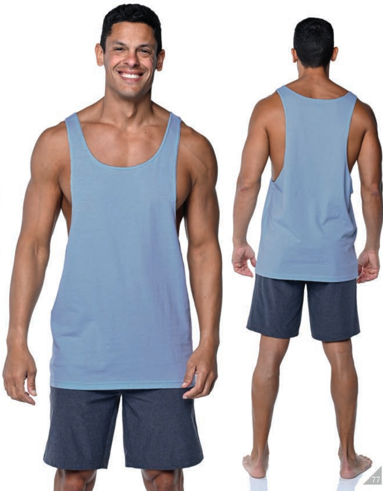
CARIBE GRAPEFRUIT VINTAGE WHITE BLACK BLUE