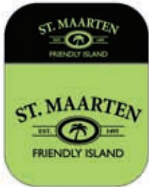
BLACK / NEON GREEN