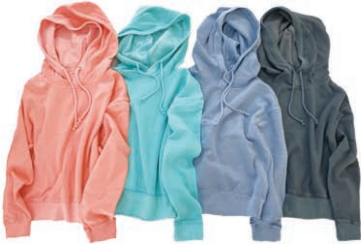
CANTALOUPE TRADEWINDS VINTAGE BLUE SEAL