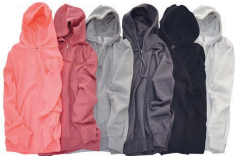
CORAL DUSTY ROSE HEATHER GREY CHARCOAL BLACK HEATHER ASH