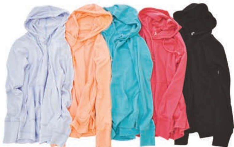
BLUE CRYSTAL CREAMSICLE AQUA TANGO RED ANTHRACITE