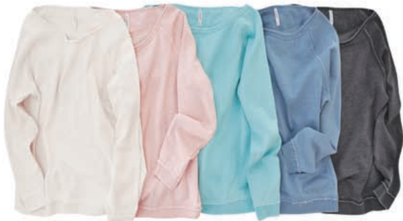
COCONUT VINTAGE ROSE DOLPHIN DENIM SHADOW