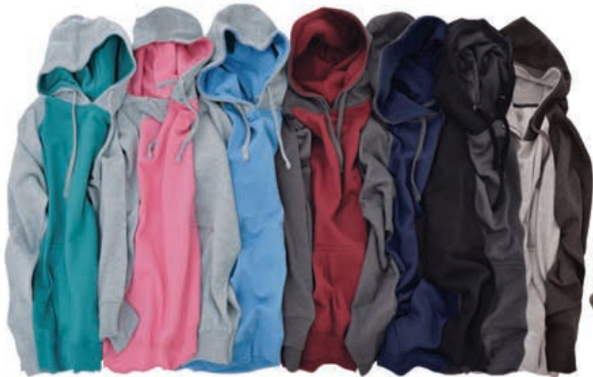
TEAL/ H. GREY PINK/ H. GREY BLUE SKIES/ H. GREY MAROON/ H. CHARCOAL NAVY/ H. CHARCOAL H. CHARCOAL/ BLACK H. GREY/ H. CHARCOAL