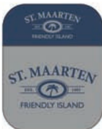
NAVY / SPORTS GREY