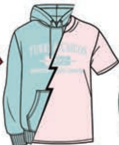
MINTY / LIGHT PINK