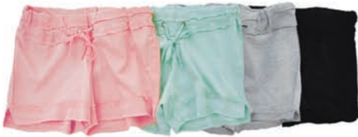
PINK AQUA HEATHER GREY BLACK