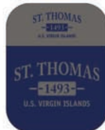
GREY / NAVY