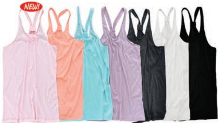
CANDY CREAMSICLE MINT TULIP BLACK WHITE ANTHRACITE PINK