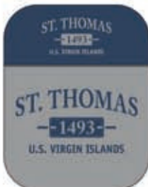
NAVY / SPORTS GREY