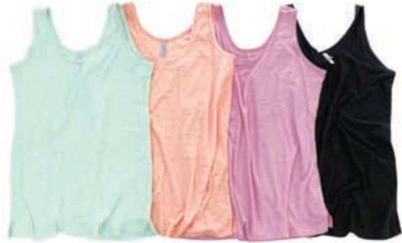
MINT SHELL ORCHID BLACK