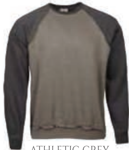
ATHLETIC GREY NAVY