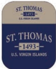
KHAKI / NAVY