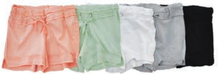
SHELL MINT WHITE* HEATHER BLACK*