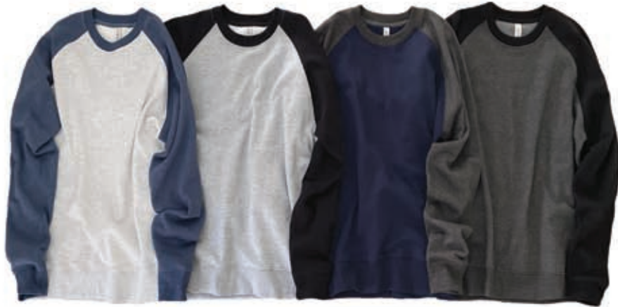
HTHR. ASH/ HTHR. NAVY