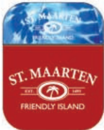
SWIRL BLUE / RED