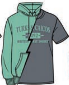
SEA GREEN / DARK/HTR