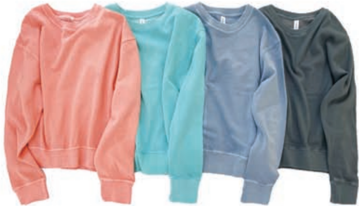
CANTALOUPE TRADEWINDS VINTAGE BLUE SEAL