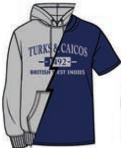
HTR. GREY / NAVY