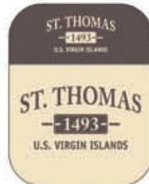
CHOCOLATE / NATURAL