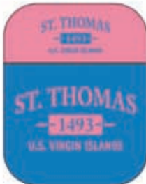
RASPBERRY / SAPHIRE