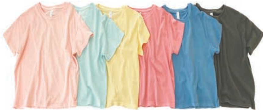
SHELL MINT BANANA GRAPEFRUIT DENIM SHADOW