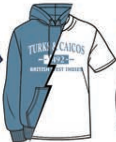
DENIM / WHITE