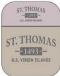
STONE / SAND