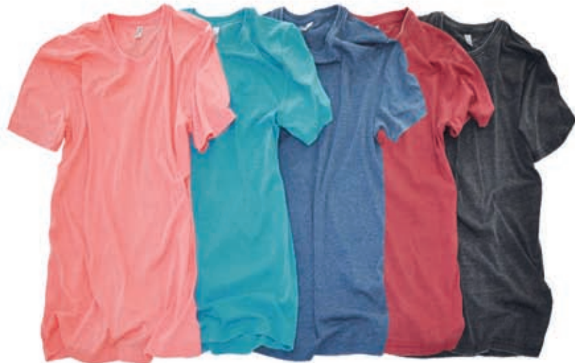
CORAL BLUE SEA NAVY WINE BLACK