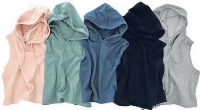
DUSTY PINK DUSTY AQUA CHAMBRAY BLACK HEATHER GREY