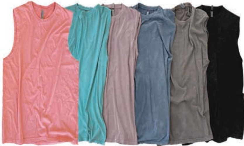
GRAPEFRUIT TEAL MIST SMOKEY BLUE DOVE GREY SHADOW