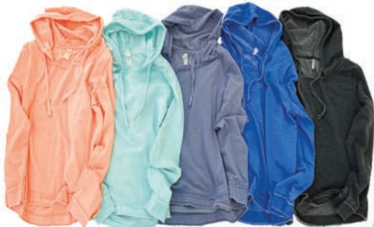
SHELL SEA SIDE SMOKEY BLUE COBALT BLACK