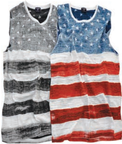
BLACK & WHITE