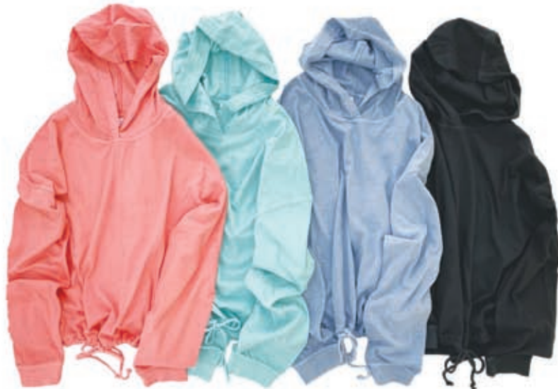
GRAPEFRUIT DOLPHIN VINTAGE BLUE BLACK SLATE