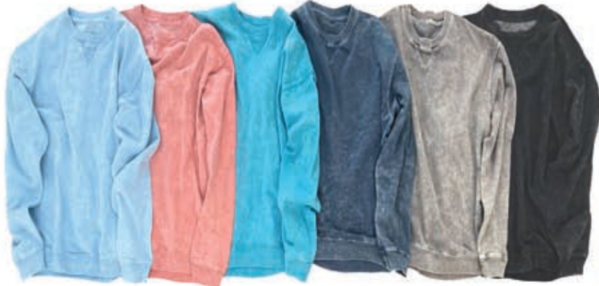
POWDER BLUE CLAY OCEANA SMOKEY BLUE DOVE GREY SHADOW