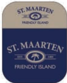
KHAKI / NAVY