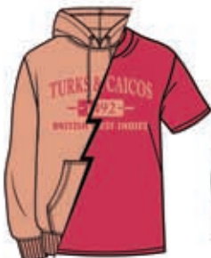
NECTOR / ANT CHERRY RED