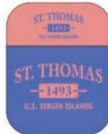
MELON / ROYAL