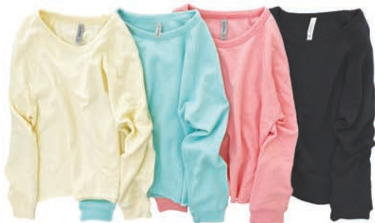
MELLOW YELLOW DOLPHIN CONCH BLACK