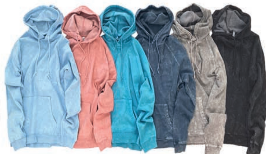
POWDER BLUE CLAY OCEANA SMOKEY BLUE DOVE GREY SHADOW