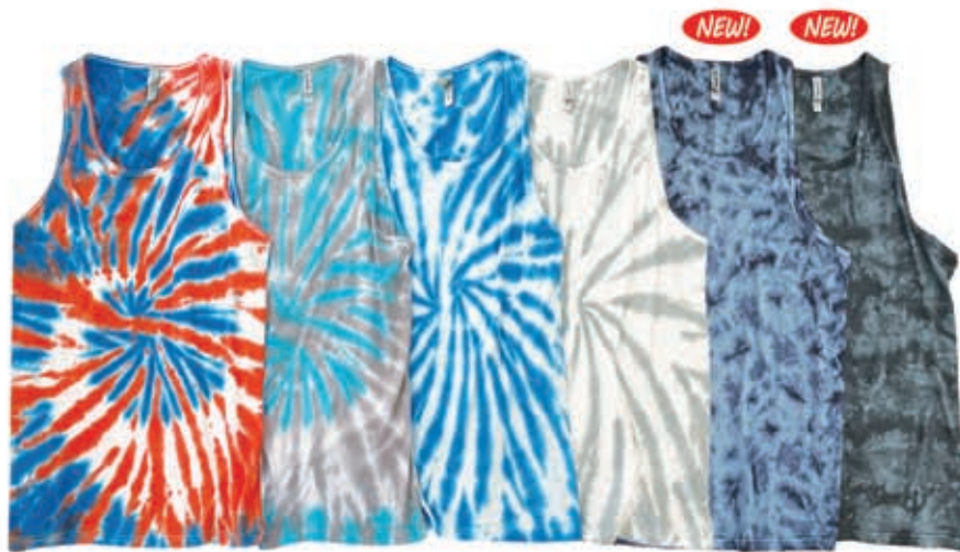
USA THE WAVE MOODY BLUE GREYSTONE NAVY BLACK