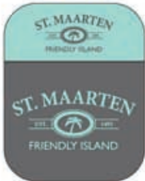
MINT / DARK HTR