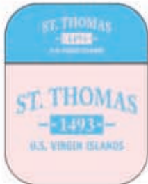
AQUA / LIGHT PINK