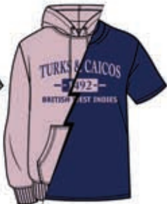
PINKY / NAVY