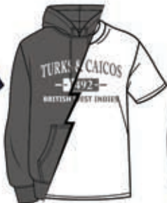
HTR. CHARCOAL / WHITE