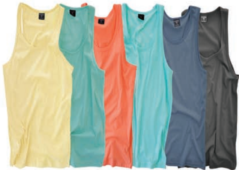
BANANA CARIBBEAN SEA ULTRA ORANGE BISCAY AQUA FADED NAVY CHARCOAL