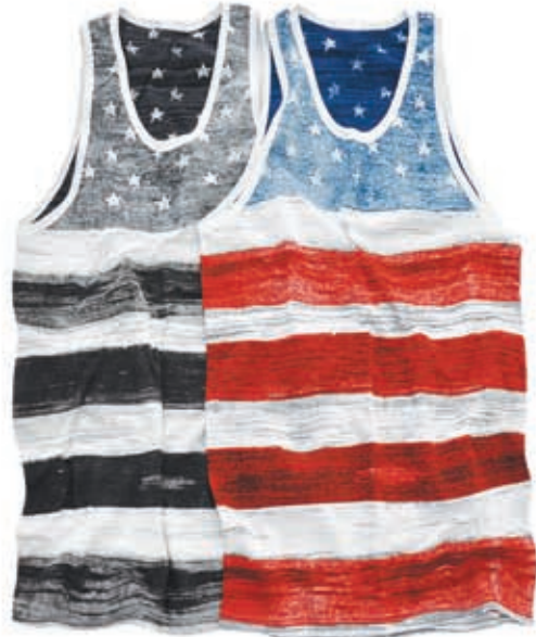
BLACK & WHITE