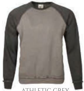
ATHLETIC GREY CHARCOAL