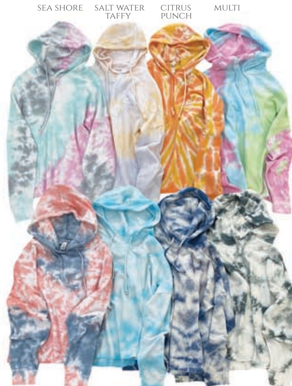
SEA SHORE SALT WATER TAFFY CITRUS PUNCH MULTI STARFISH SKY BLUE CHAMBRAY CHARCOAL