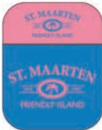
RASPBERRY / SAPHIRE