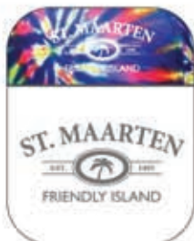
REVERSE / WHITE