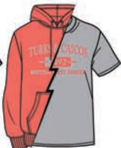
CORAL / GRAPHITE