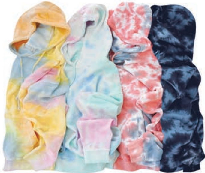
KAUAI COTTON CANDY AMERICANA NAVY