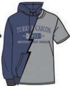
HTR. NAVY / S. GREY