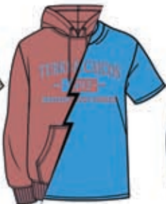
DUSTY ROSE / SAPPHIRE