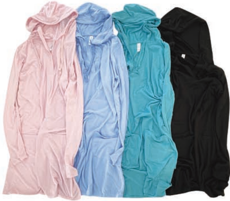
PINK PERSIAN BLUE OCEAN TEAL BLACK