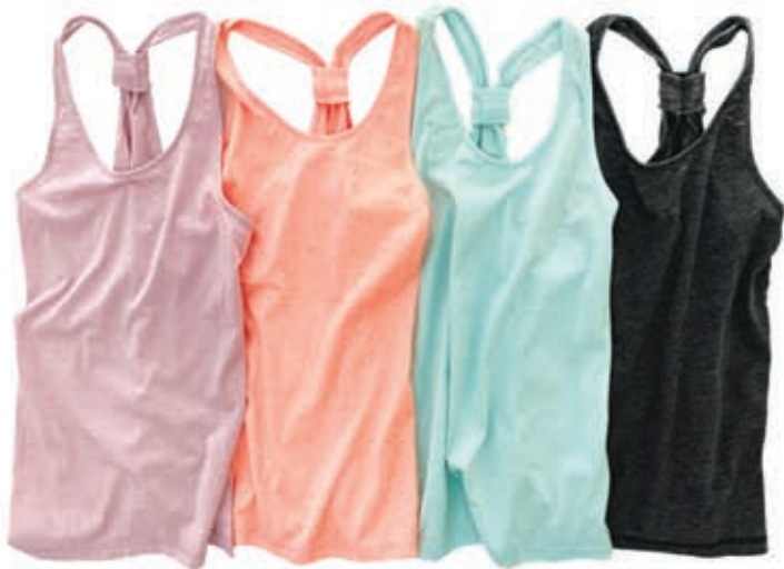
TULIP CREAMSICLE MINT BLACK