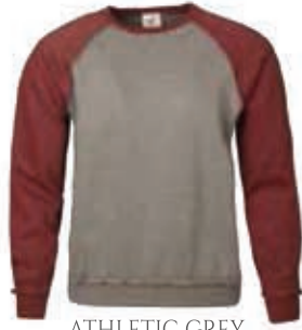
ATHLETIC GREY MAROON