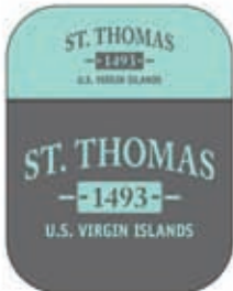
MINT / DARK HTR