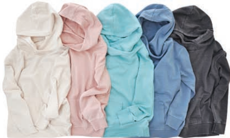
COCONUT VINTAGE ROSE DOLPHIN DENIM SHADOW