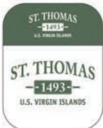
GREEN / WHITE