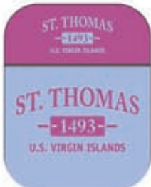
RED / LIGHT BLUE