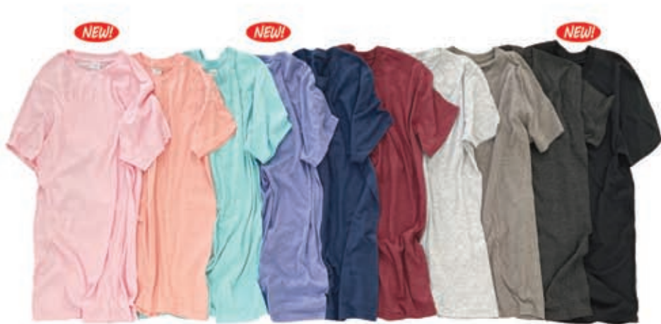
PINK HTHR SHELL HTHR SEA GREEN HTHR PERI HTHR *NAVY HTHR MAROON HTHR *ATHLETIC GREY HTHR *CHARCOAL HTHR *BLACK HTHR