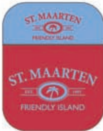
BLUE / CARDINAL