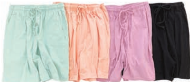
MINT SHELL ORCHID BLACK