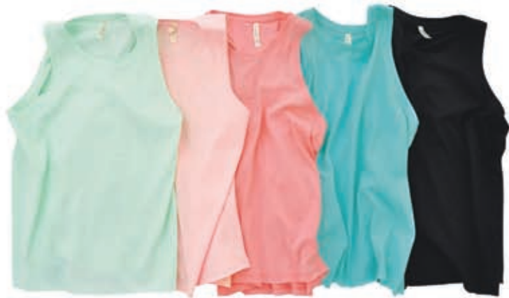
MINT NECTAR GRAPEFRUIT AQUA BLACK