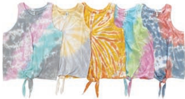
SEA SHORE SALT WATER TAFFY CITRUS PUNCH MULTI STARFISH